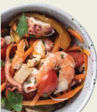
SEAFOOD SALAD / 100 G POACHED PRAWN AND OCTOPUS SALAD WITH SHREDDED CARROTS AND CHILIES