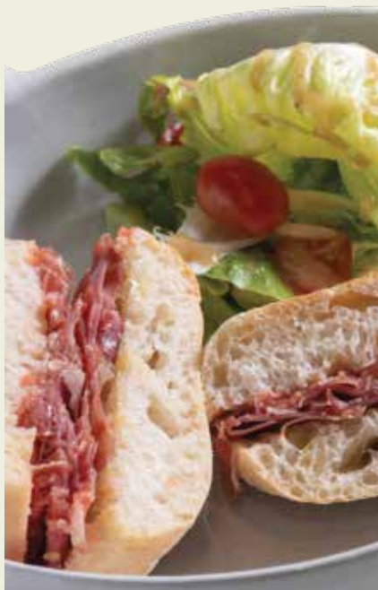
IBERICO SANDWICH IBERICO CAMPO, TOMATO, OLIVE OIL