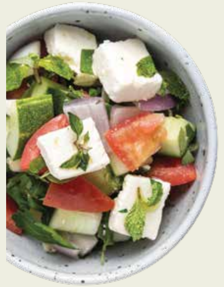
GREEK SALAD / 100 G