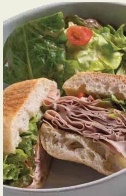
MORTADELLA SANDWICH HOMEMADE MORTADELLA, PRESERVED BELL PEPPERS, RED OAK, OLIVE OIL, OLIVES