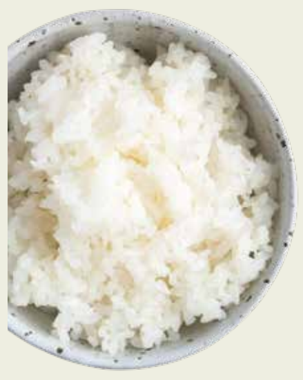
JAPANESE RICE / 100 G