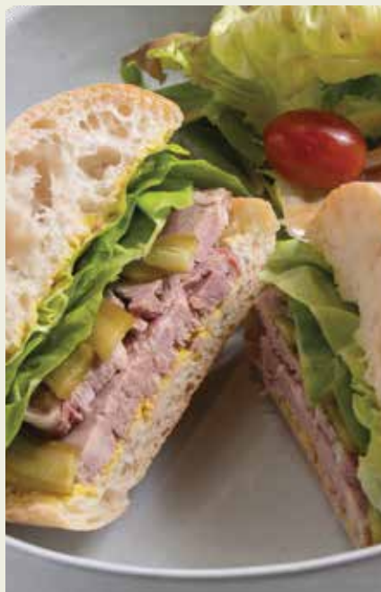
COUNTRY PATE SANDWICH HOMEMADE COUNTRY PATE, RED OAK TRADITIONAL MUSTARD, PICKLED CUCUMBER