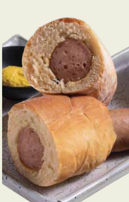
HOT DOG STRASBOURG SAUSAGE WITH TRADITIONAL MUSTARD FROM MAISON CLARANCE