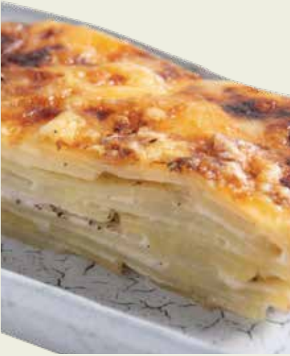
GRATIN DAUPHINOIS / 100 G