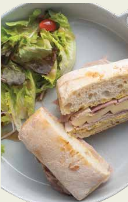
AVRIL GOURMET HAM & CHEESE SANDWICH HOMEMADE PARIS HAM, TRADITIONAL MUSTARD BORDIER TRUFFLE GOUDA - BORDIER BUTTER