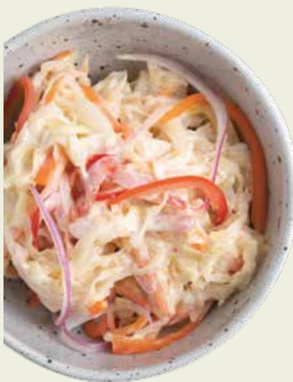
COLESLAW / 100 G