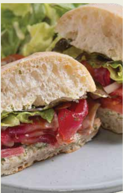
SMOKED SALMON SANDWICH HOMEMADE SMOKED SALMON, DILL CREAM, TOMATO, RED ONION, LETTUCE