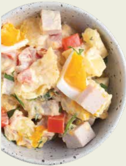
PIEMONTAISE SALAD / 100 G