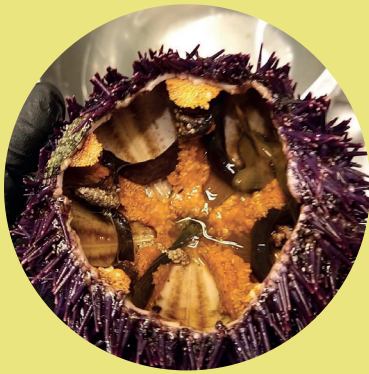
Live Sea Urchin 520.- /100g