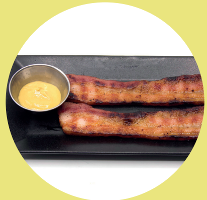
Apple Wood Chips Smoked Bacon 320.- Mustard