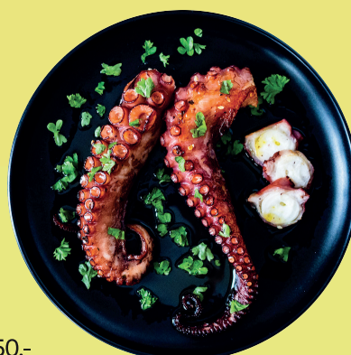
Grilled Octopus Tentacles 1,450.-

Prices are subject to 10% Service and 7% VAT