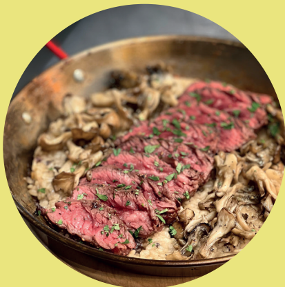
Wagyu Beef PAELLA 1,850.- Charred Maitake Mushrooms