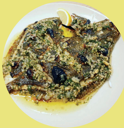
Josper Grilled Turbot 360.-/100g Pan Sauce: Lemon/ Capers