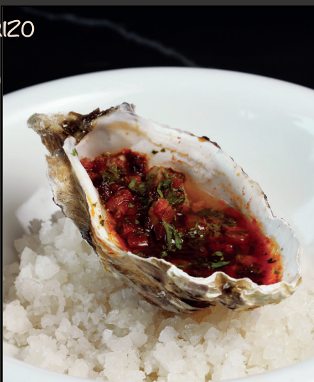
CHORIZO 680.- (3pcs)