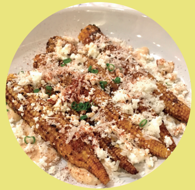
Charred Baby Corn 320.- Feta Cheese/Smoked Paprika