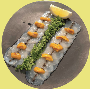
Wild Scallops Uni Carpaccio 1,350.- Hokkaido Wild Scallops/ Sea Urchin/ Truffle Vinaigrette