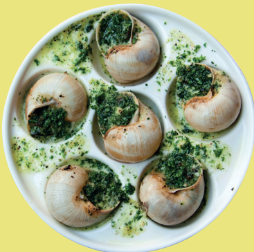
Escargots Bourguignone 590.-