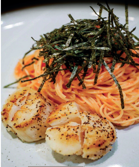
Angel Hair Vongole' 720.- Clams/ White Wine