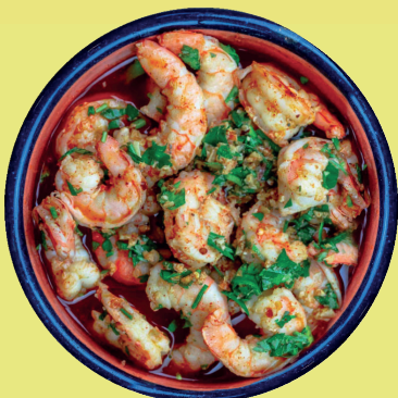
Gambas al Ajillo 450.- Spanish Garlic Prawns