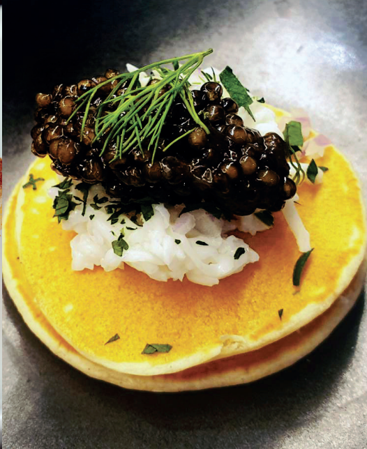
CLASSIC BLINI CAVIAR