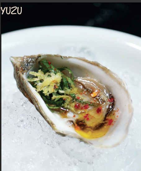
KOCHIYUZU 680.- (3pcs)