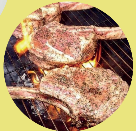
Ebony Black Angus TOMAHAWK 600.-/100g