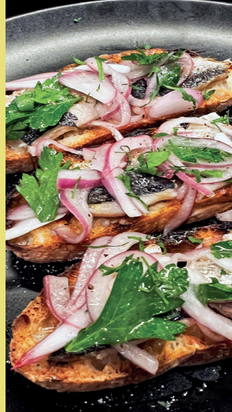
Grilled Sardine Toast