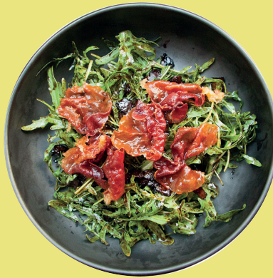
Warm Rocket Salad 350.- Crispy Parma Ham/Bacon/Balsamic Reduction