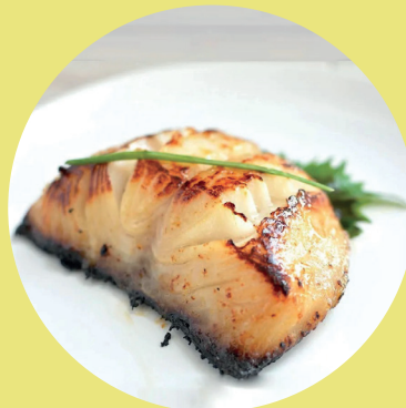
Gindara Japanese Black Cod 720.- Miso/ Charred Vegetables