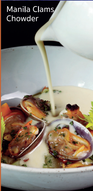
Manila Clams Chowder